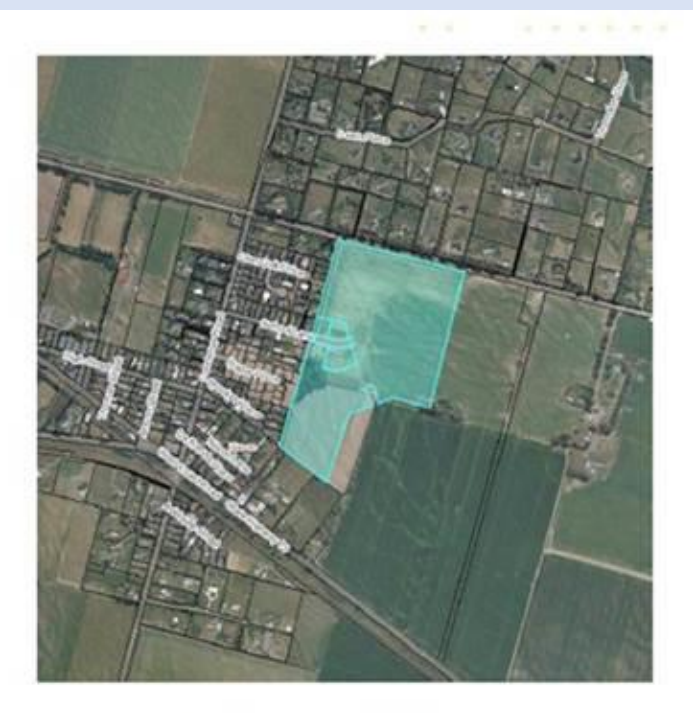
Figure 4: Plan Change site identified in blue.

The full plan change application is now on Council's website and can be downloaded here.