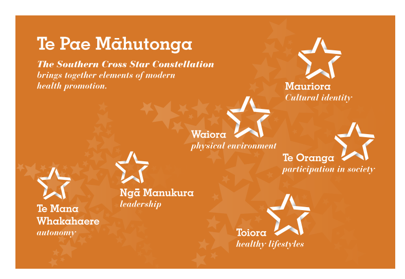
Figure 3. Te Pae Māhutonga brings together elements of modern health promotion

Tools to Support a Health in All Policies Approach gives further information on Te Pae Māhutonga and other Māori models of health. (See the References and Resources section.)