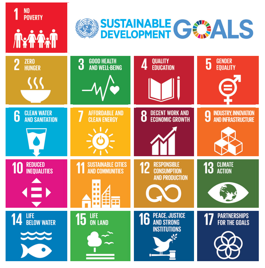
Figure 5. The 17 Sustainable Development Goals of the United Nations' 2030 Agenda for Sustainable Development

The Sustainable Development Goals (SDGs) are a collection of 17 interrelated goals set by the United Nations to end poverty, protect the planet and ensure prosperity for all. As a global, national and local social contract, in which communication, participation and partnership are key, the SDGs demand fresh attention to governance where multi-stakeholder and multi-dimensional approaches and collaboration are the norm. Almost all the SDGs are directly related to health and wellbeing or will indirectly contribute to improving health.